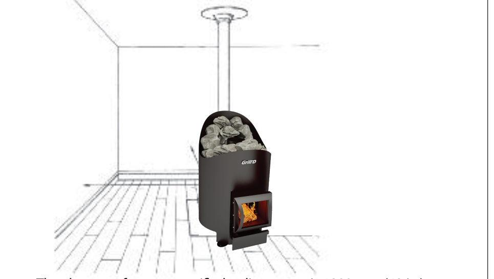
The clearance for an uncertified radiant stove is 1200 mm (48 in.) and for a stove with a sheet metal jacket or casing the clearance is 900 mm (36 in.). The clearances are large because they apply to all shapes, sizes and designs of stoves that have not been tested to determine the actual clearances.

They are less efficient than safety certified, advancedtechnology stoves and they produce a lot more air pollution.